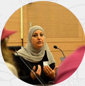
Activists speaking at the Knesset, June 2023